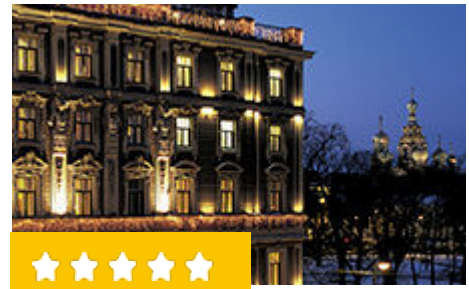
Belmond Grand Hotel Europe