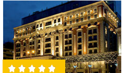
Holiday Inn Moscow Sokolniki