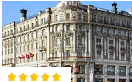
Hotel National, a Luxury Collection, Moscow