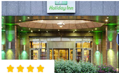
Holiday Inn Moscow Sokolniki